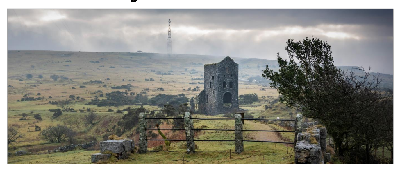
Appendix 1: World Heritage Site Area Statements A1-A10