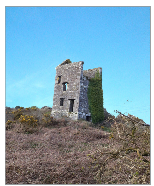
Wheal Ann. Photo: Audio Trails

Wendron became known as a rich tin producing area and the sheer number of individual