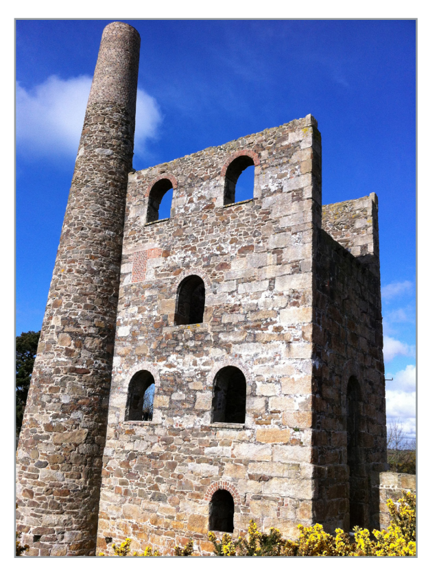
Wheal Peevor engine house.